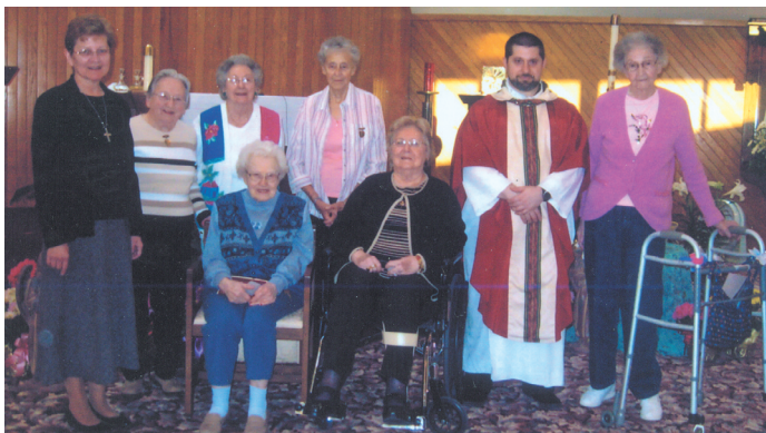
Our Lady of the Blessed Sacrament II, Group #2 – Fort Wayne, Indiana.